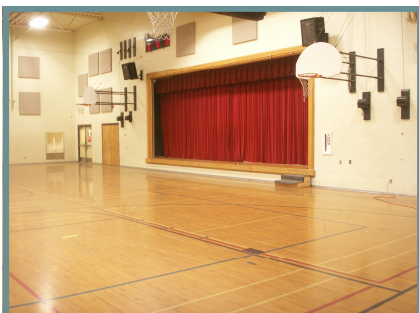
Auditorium Stage Inside Gymnasium

This stage in a combined gymnasium/auditorium at Lane is a good example which illustrate a common existing school design where a backstage lift or ramp for stage access is preferred to avoid creating a safety hazard during gym use.